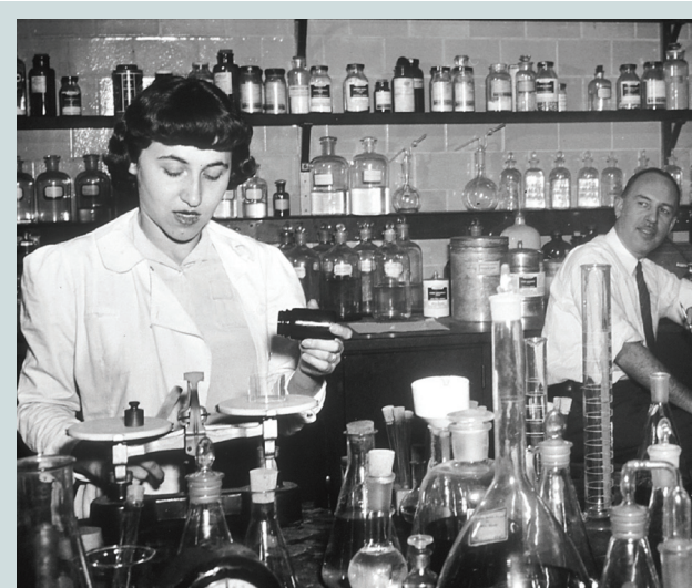
Figure 2. The Beginning of the National Cancer Institute's Chemotherapy Testing Program

Acknowledgment of the anguish and disfigurement associated with radical mastectomy inspired Jeanne C. Quint (1963) to more fully explore the impact of mastectomy. Quint was an early nurse researcher using qualitative methodology, mentored by Anselm Strauss in data