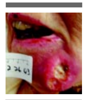
FIGURE 1. ORAL LESION PRIOR TO METRONIDAZOLE THERAPY

Head and neck-related cancers are a growing problem in the United States. In 2004, an estimated 28,260 Americans will be diagnosed with cancers of the oral cavity and pharynx and 7,230 will die from these diseases. Although more common among men, cancers of the head and neck do occur in women, and an estimated 9,710 women will be diagnosed with cancer of the mouth in 2004 (Jemal et al., 2004).