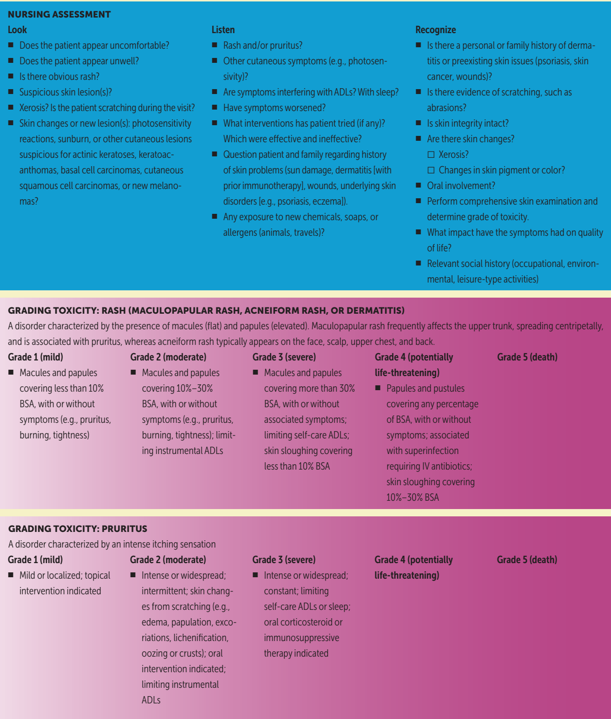
FIGURE 3. CARE STEP PATHWAY FOR MANAGEMENT OF SKIN TOXICITY