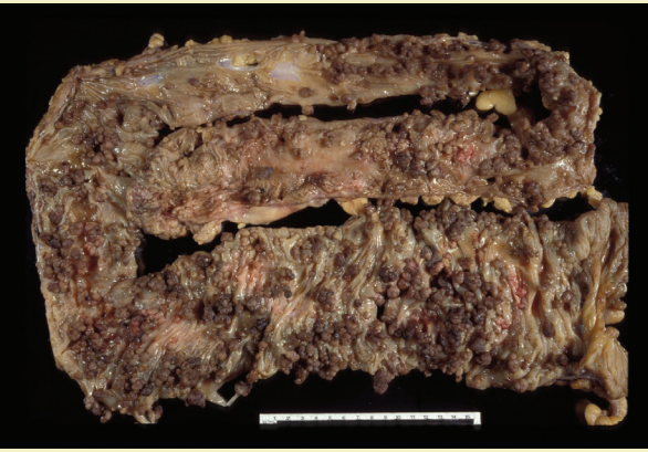
FIGURE 2. SURGICALLY RESECTED BOWEL WITH POLYPS

Note. This surgically resected bowel shows a "carpet of polyps," which is typically seen in familial adenomatous polyposis.