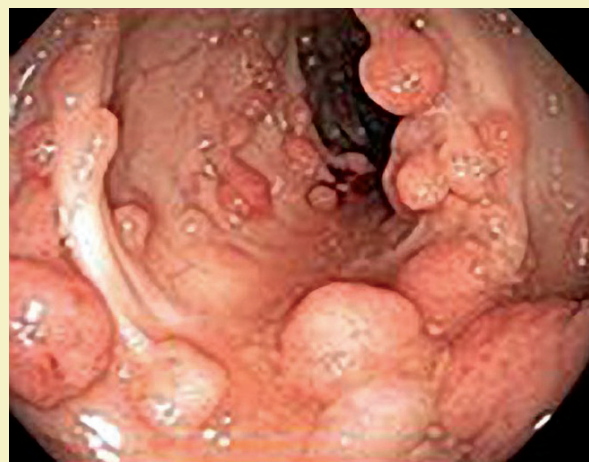
FIGURE 4. BOWEL ENDOSCOPY WITH POLYPS

Note. This bowel endoscopy shows polyps that are typically seen in familial adenomatous polyposis.