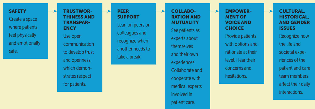
FIGURE 1. TRAUMA-INFORMED CARE MODEL

Note. Based on information from Centers for Disease Control and Prevention, 2018; Hales et al., 2019; Mahon, 2022.